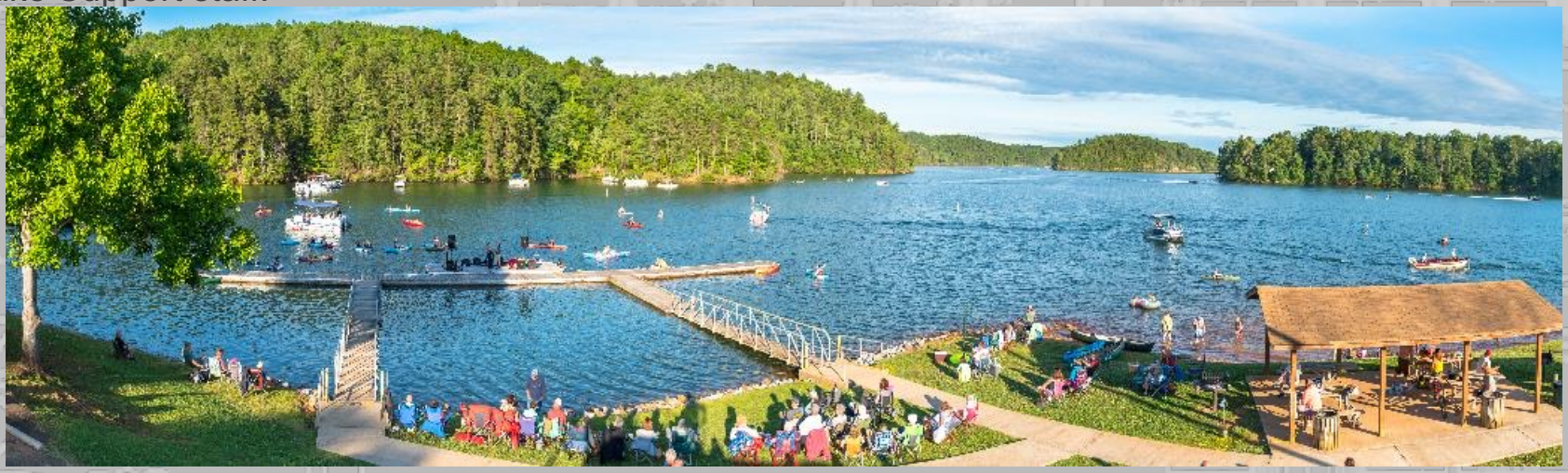
Working Today to Build a Better Tomorrow

Sponsored by Franklin County Parks and Recreation, Twin Ridge Recreation Area on Philpott Lake was the summer designation for concerts by canoe. Three concerts took place this 2021 summer season drawing crowds of more than 150 each time. Spectators could sit along the shoreline, paddle around the dock or boat in to watch local bands play live music on the dock. USACE set up a booth each time to deliver water safety message and interact with the public. A team effort by Franklin County Parks and Recreation staff, Philpott Rangers, USACE Volunteers, and Lake Support staff.